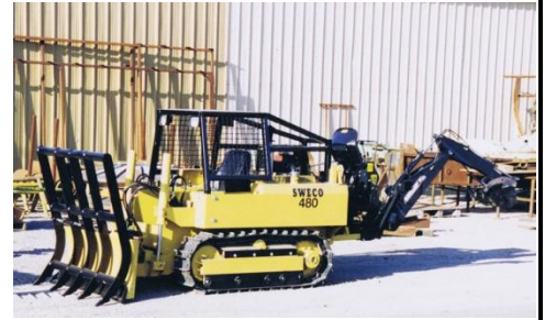
“Home of the SWECO 480 Trail Dozer”

Various Dozer Smooth Rollers & Sheep Foot Rollers Available