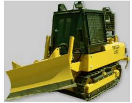
“Home of the SWECO 480 Trail Dozer”